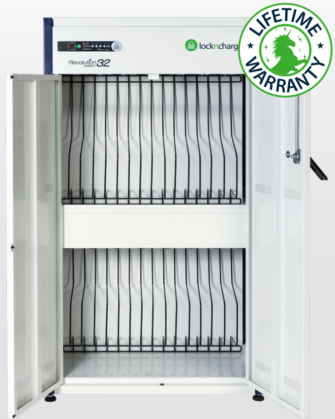
Specs: 55.7" (H) x 31.7" (W) x 16.5" (L) | 121.2 lbs